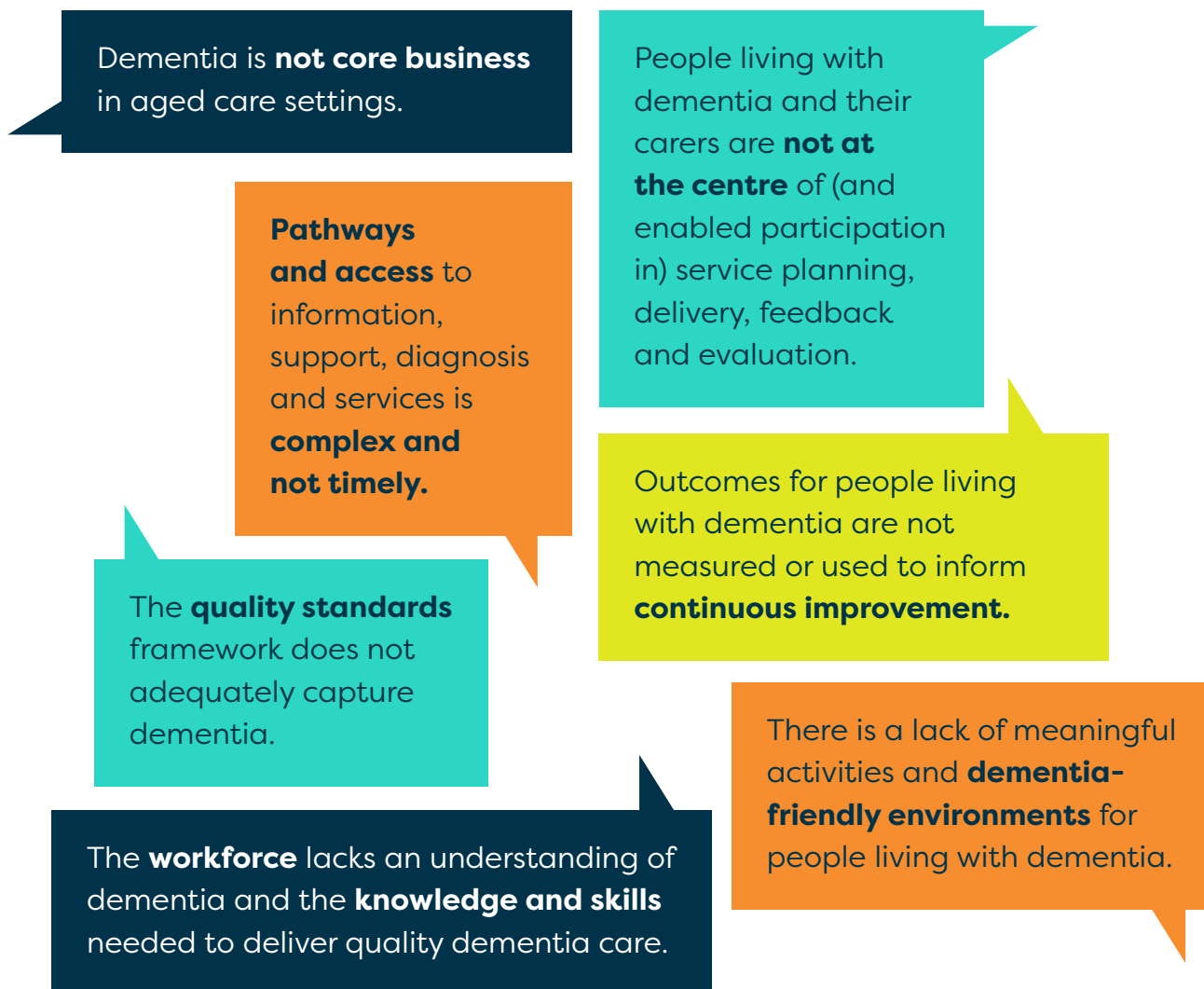
Figure 1: The most significant system issues as identified by people living with dementia

The Royal Commission has brought focus to key themes for the aged care sector to better meet the needs of people living with dementia, their families and carers, including dementia support pathways; specialist dementia care services; workforce education; and dementia-friendly design of aged care accommodation.